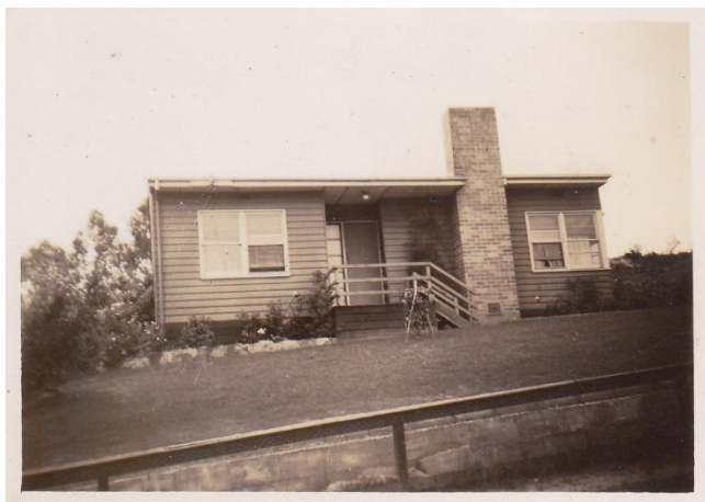
Photo circa 1946 of 10 Moondarra Place, Yallourn.